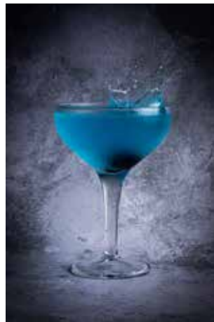
Blue Moon Sake 11.50

Blend of Rum, fresh strawberries, lemon juice and a strawberry syrup.