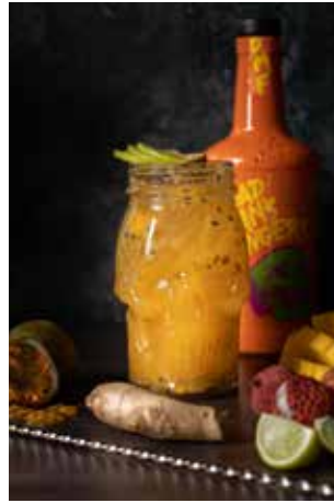
Passion Dragon 11.50

Deadman's Pineapple Rum, Pineapple Juice, Lime Juice