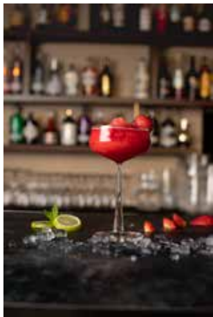
Strawberry Daiquiri 11.50

Deadman's Spiced Rum, Mango Juice, Lychee Juice, Passion Fruit Juice, Ginger Beer