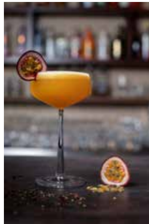
Passion fruit Martini 12.50

Deadman's Coconut Rum, Coconut cream, Pineapple Juice