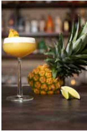
Pineapple Daiquiri 11.50