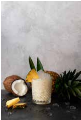
Tokyo Colada 11.50